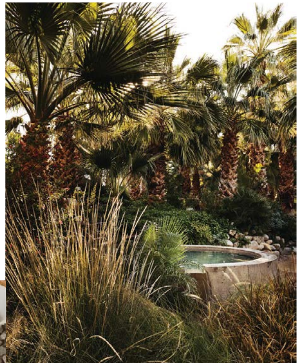
SPARROWS LODGE PHOTO BY JAMIE KOWAL; TWO BUNCH PALMS PHOTOS BY DYLAN + JENI

and private pool with cabanas can provide parents with some much-needed R&R. Each Spanish Colonial-inspired room comes equipped with French doors opening to furnished private patios or balconies, providing the utmost relaxation. omnirancholaspalmas.com ■