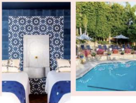
PHOTOGRAPHS: LOBBY: TIM STREET; PORTIER: BEDROOM AND EXTERIOR: JAMIE KONAL; PHOTOGRAPHER

STAY: The Spanish Colonial buildings of the maze-like 23-room CASA LAGUNA HOTEL & SPA (shown) were renovated and redesigned by Martyn Lawrence Bullard to preserve their eclectic architecture and turn the property into a stylish, comfortable inn. From $329/night. CASALAGUNA.COM .