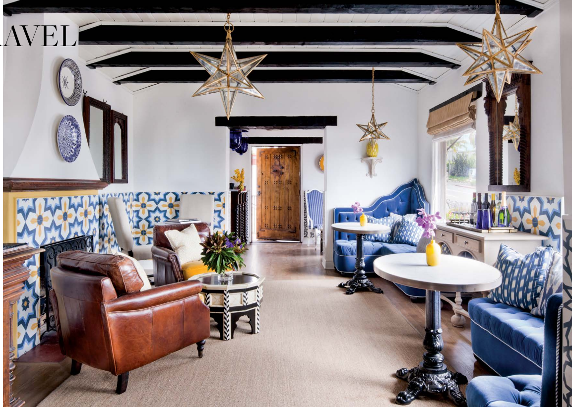
Interior designer Martyn Lawrence Bullard brought touches of Moroccan flavor with Moorish tiles, ceramics, fixtures and finishings to Orange County's reimagined CASA LAGUNA HOTEL & SPA .

➤ Laguna Beach is known for many things: an idyllic coastal perch, the arts festival Pageant of the Masters and a certain MTV reality show among them. Add design-centric boutique hotels to the list, thanks to a splashy new venue that debuted in April. With a beguiling setting overlooking the ocean and vivid decor conceived by Los Angeles-based interiors guru Martyn Lawrence Bullard, Casa Laguna Hotel & Spa is a visual spectacle. Surprisingly, the property's not new at all: Bullard has thoughtfully reimagined the early-20th-century Spanish Colonial estate (a registered historic structure) with its white-washed villas and terra-cotta roofs and given it a fresh new ethos. "The architectural style